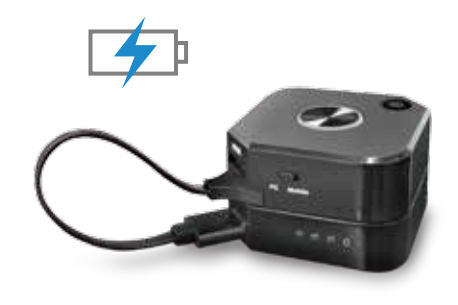
Portable battery (optional) Designed for QuattroPod Mini to present wirelessly from any corner of the meeting room