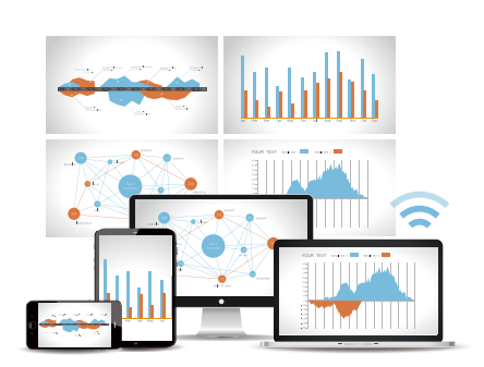
Cross platform wireless presentations Support all OS devices