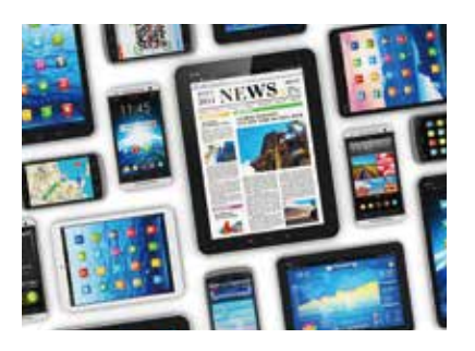
Mobile devices Compatible across all mobile devices