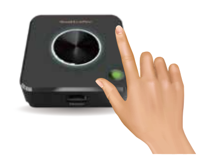
Host control Control the flow of presentations at your fingertips