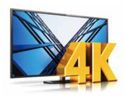
4K resolution Support 4K screen cast