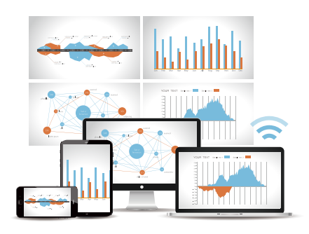
Cross platform wireless presentations Support all OS devices